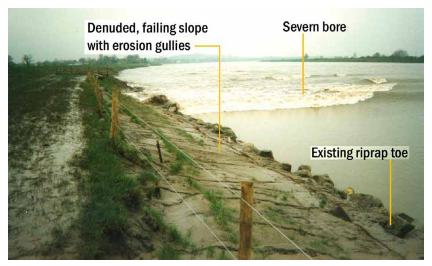
Eroding banks at Longney